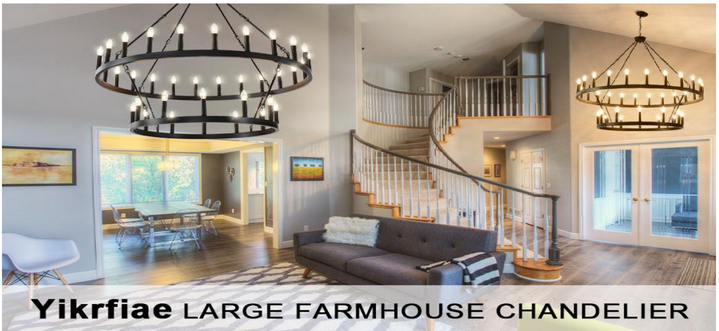
Yikrfiae LARGE FARMHOUSE CHANDELIER

To fit diverse locations and aesthetics, wagon wheel chandeliers are available in a range of sizes and designs. When deciding on the right size for your chandelier, take into account the dimensions of your space and the height of the ceiling. Choose a grander chandelier with more tiers and more lights for larger rooms or high ceilings rather than a compact and basic design for smaller ones. Wagon wheel chandeliers are also available in a variety of finishes, such as sleek black metal for a contemporary design and distressed wood for a vintage sense.